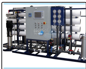
Industrial RO Plant