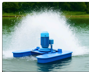
Water Aeration System