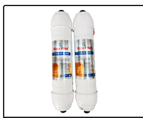
Inline Set Push Fit