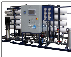
Industrial RO Plant