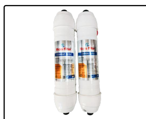
Inline Set Push Fit